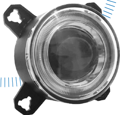
LED Position Light