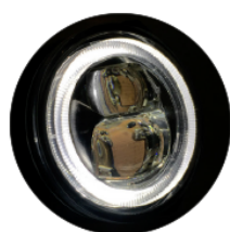
LED Position Light